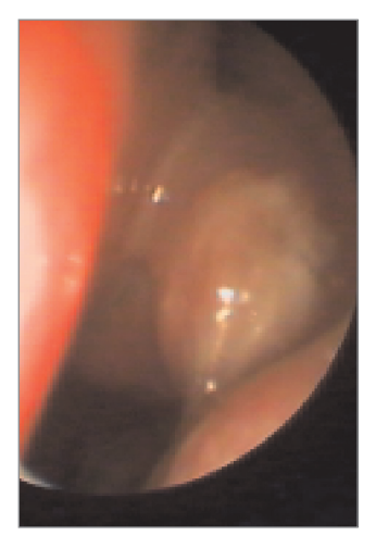
Fig. 5. Video rhinoendoscopy. Patient N., 17 yrs. Diagnosis: BA of moderate severity, allergic, controlled. Perennial allergic rhinitis, persistent, moderate severity. Nasal septum deviation + turbinate deviations. Developing polypus of middle concha, on the left

patients without BA) hyperplastic changes of mucosa were revealed only in 5 children (1.5% of the group). Two of them appeared to have rhinitis medicamentosa, 2 patients — AR (age 14 and 16 yrs), and in 1 patient aged 8 years old with the diagnosis of mucoviscidosis, video endoscopy revealed the polyps of nasal cavity. A part of the patients with hypertrophic changes of nasal mucosa among BA patients exceeded statistically significantly the part of the patients with the same pathology in comparison group (Z=5.83; p=0.0001).