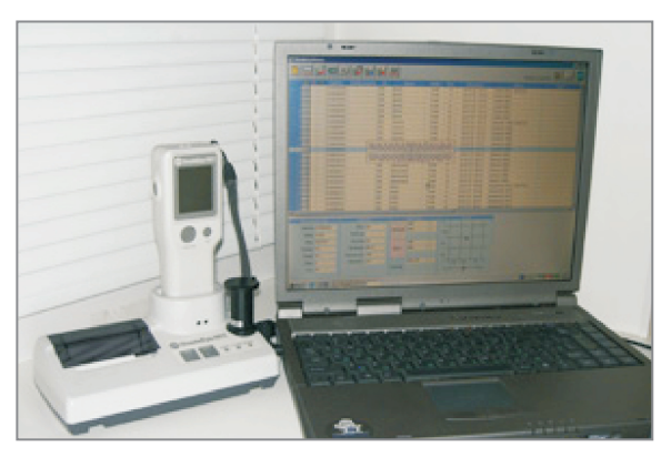
Fig. 2. Shade taking device SHADE EYE NCC

For contacts: Zhdanova Mariya Leonidovna, phone: 8(831)419-78-52, +7 910-799-55-74; e-mail: marikac3@mail.ru