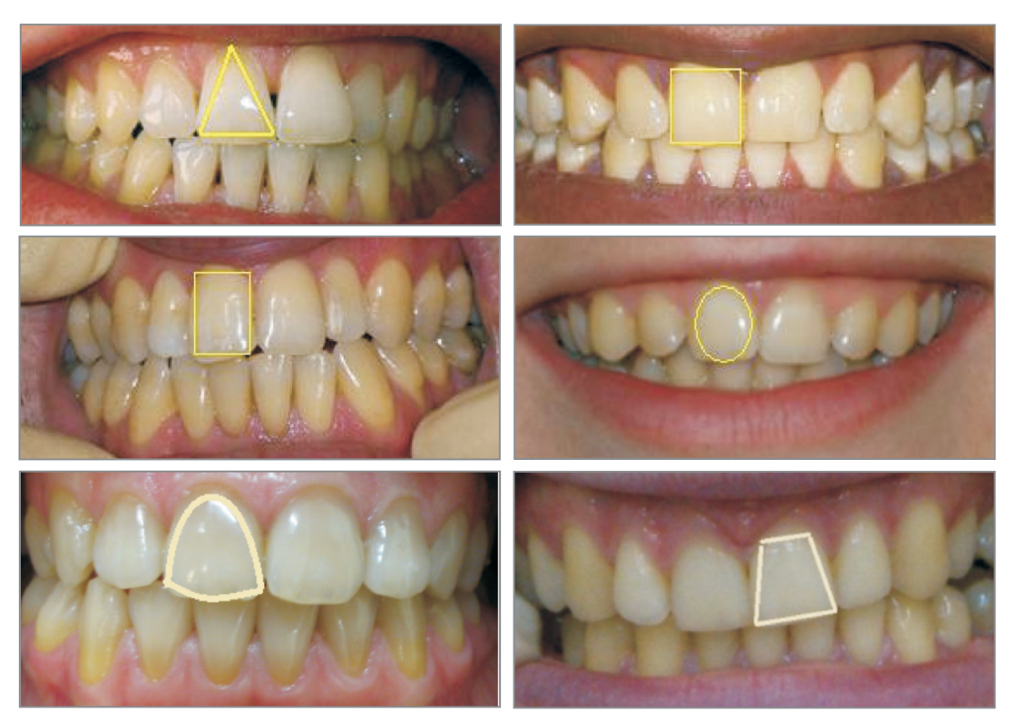
Fig. 5. The shape of the first incisor conforming the type of face

The first type is found in 19% of cases (Fig. 6), it has a square shape, the parallel of medial and distal contact surfaces being noted throughout the height of the tooth of the clinical crown. Lines drawn from the cheek bone toward the corners of the lower jaw are also parallel.