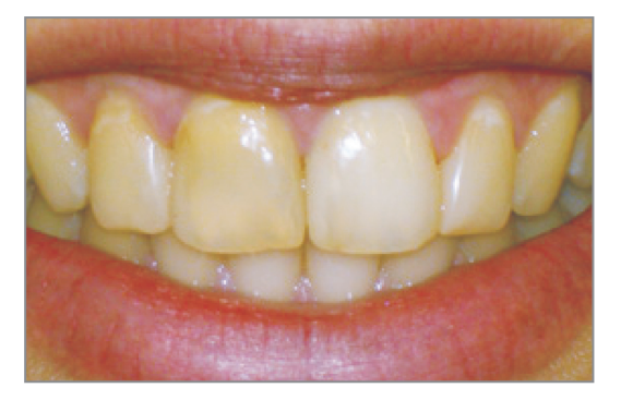
Fig. 7. Discoloration of tooth enamel 1.1

aware of the possibilities of aesthetic dentistry and expect that they will receive good results due to the restoration.