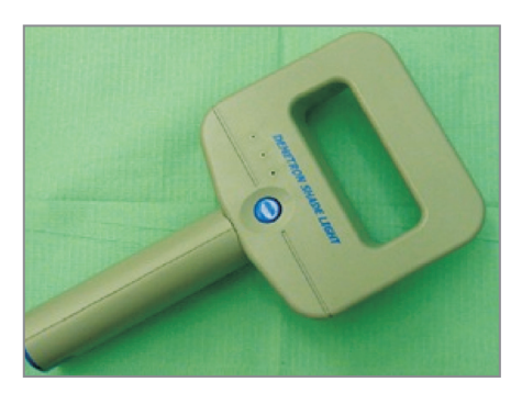
Fig. 1. Demetron Shade Light Lamp

We used shadowless lamp Demetron Shade Light (Fig. 1), the instrument for determining the color SHADE EYE NCC (Fig. 2), and a device for determining the color developed by us [9] (Fig. 3).