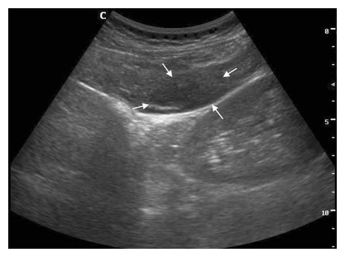
Fig. 3. Novocain infiltrate near the lower pole of the kidney in the form of hypoechogenic space with an unclear outline (arrows)

less clear in 2–3 min after introduction, and in 5–7 min it acquires sufficient echogenicity, making visualization of the needle tip difficult. In 10–15 min the area of injected anesthetic presents simply a hypogenic zone in paranephry. Such a short duration of optimal visualization conditions requires quick actions from the whole personnel, performing punctional biopsy.